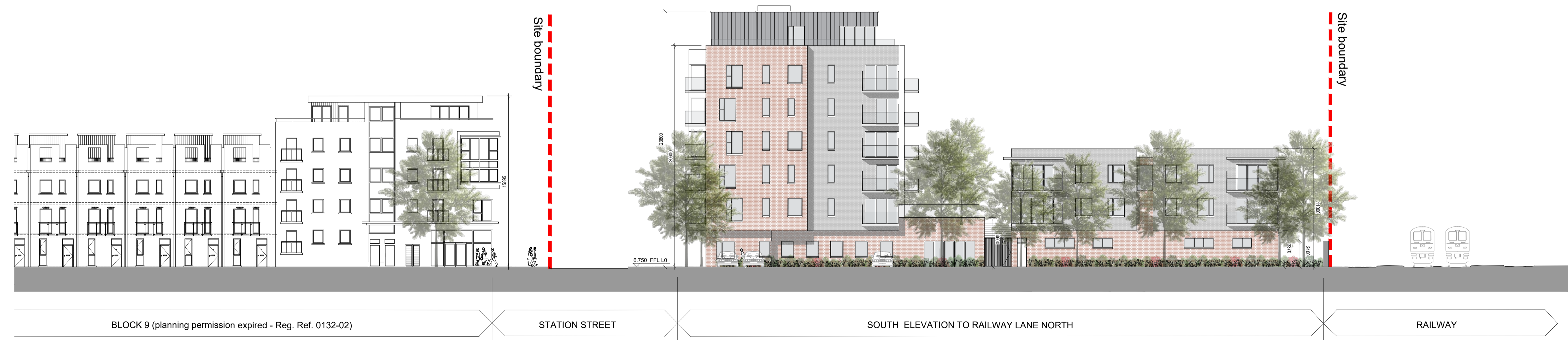
BLOCK 8 - SOUTH ELEVATION TO RAILWAY LANE NORTH