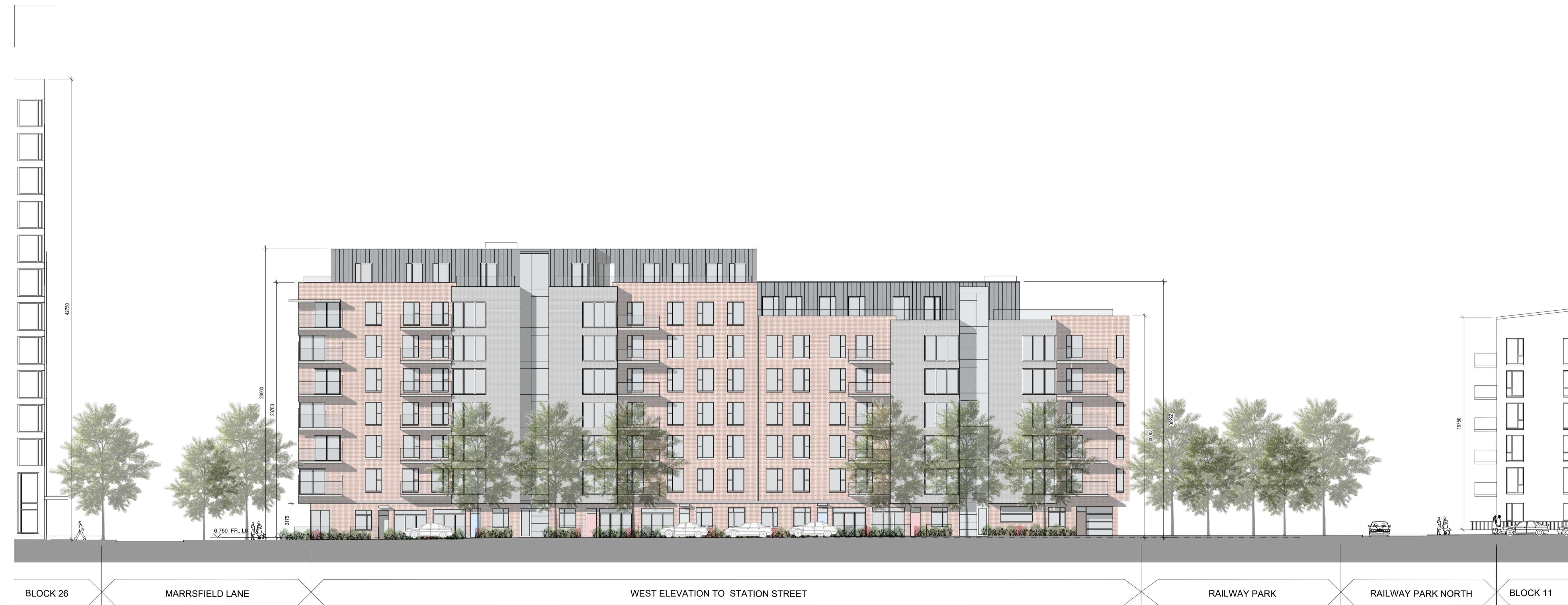
BLOCK 8 - WEST ELEVATION TO STATION STREET